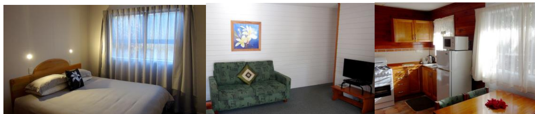
ADULT PACKAGE PRICES - 8 days / 7 nights

Included: Daily Car Hire per unit (petrol usage extra), Return Airport Transfers & Half Day Island Tour