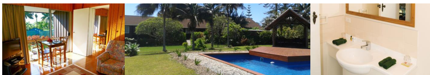
ADULT PACKAGE PRICES - 8 days / 7 nights

Included: Daily Car Hire per unit (petrol usage extra), Return Airport Transfers & Half Day Island Tour