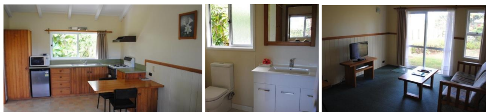
ADULT PACKAGE PRICES – 8 days / 7 nights

Included: Daily Car Hire per unit (petrol usage extra), Return Airport Transfers & Half Day Island Tour